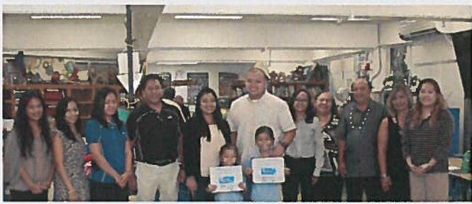
2016 Family Read-A-Thon 1st Place Winners

PBS Guam/KGTF continues to produce the Academic Challenge Bowl for the Dept. of Education Gifted and Talented Program, where hundreds of Guam junior and high school students, both public and private, have represented their schools over the years.